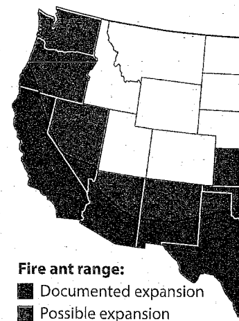
Figure 1. Fire ant colonies in the U.S.